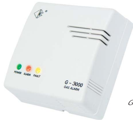
G - 3000