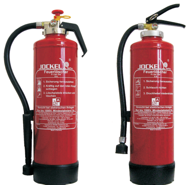
G 6 SDJ Gel