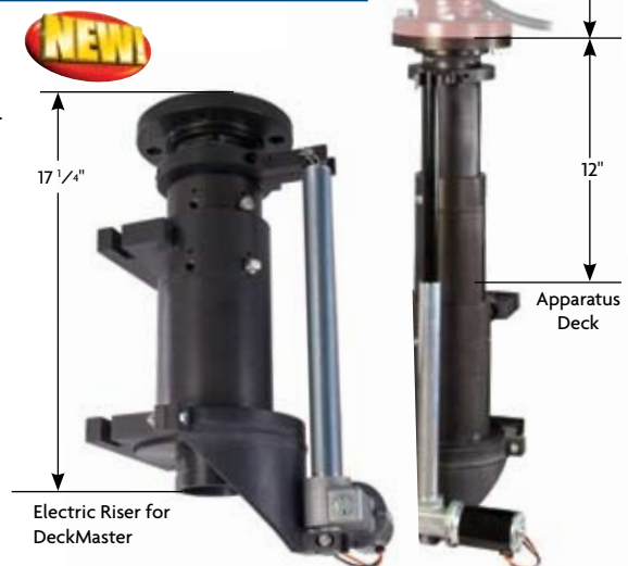
Electric Riser for DeckMaster