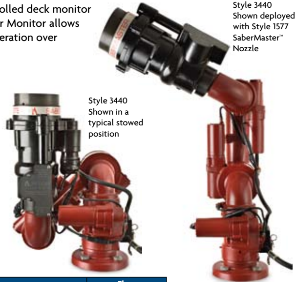
Style 3440 Shown deployed with Style 1577 SaberMaster™ Nozzle

See page 45 for Electric Monitor Accessories