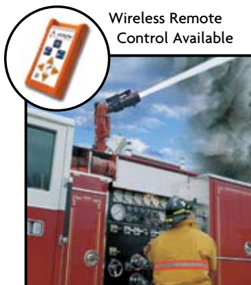
Wireless Remote Control Available

Combine with the new SaberMaster nozzle to meet new NFPA 1901 recommendations to use remote control monitors for safe deck gun operations.