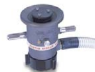
Style 887 Self-Educting Nozzle (500 GPM)