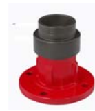
Style 190 Direct Mount Flange