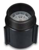
Style 119 Stream Shaper