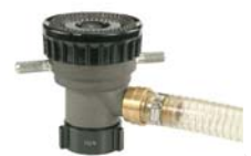
Style 888 Self-Educting Nozzle (750 GPM)